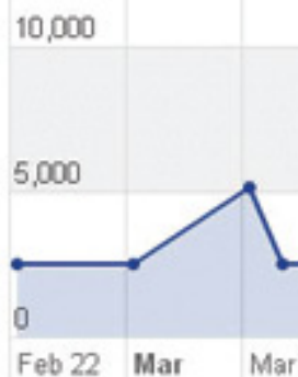
chart by amCharts.com